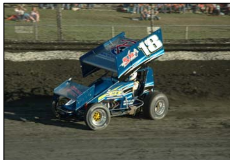
Skagit Speedway in Burlington