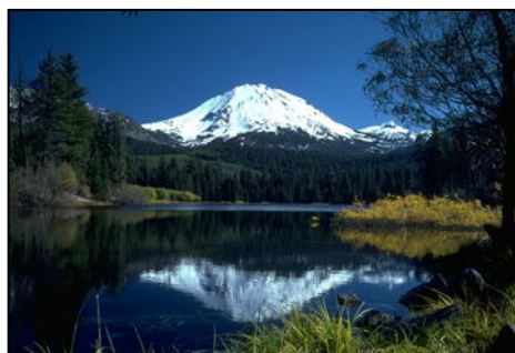
The Cascade Mountains