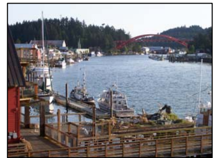
Rainbow Bridge in LaConner